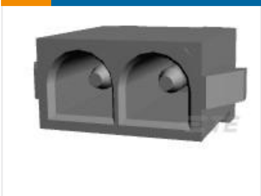
TE Part #350428-1 02P UMNL PIN HDR ASSY NATL