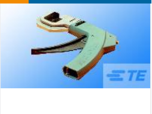
TE Part #58246-1 MTA 100 CRIMP HEAD REPAIR DISCRETE