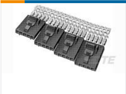
TE Part #5-103961-3 5X4 MTE RCPT SR LATHC .100CL