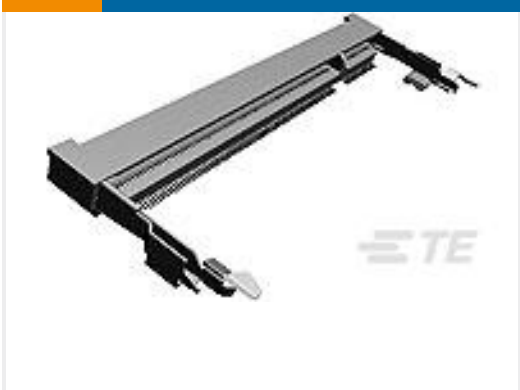
TE Part #1473005-1 SEMI HARD TRAY DDR SOCKET 200P