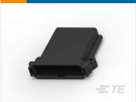
TE Part #EEC-325X4B ENCLOSURE, 3.25 X 4, BLK, NO VENT