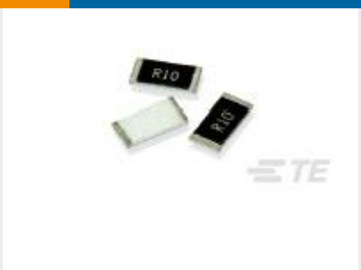
TE Part #2176055-1 RLP73V 2B R010 1% 1K RL