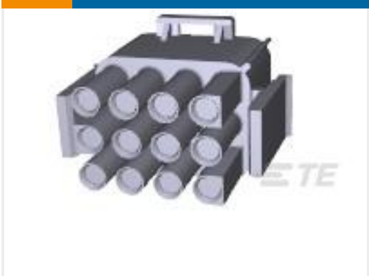
TE Part #350735-4 12P UMNL PLUG HSG UL94VO