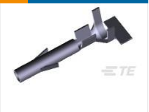
TE Part #350537-6 UMNL SOK 20-14 .0125 AUNI/PHBZ