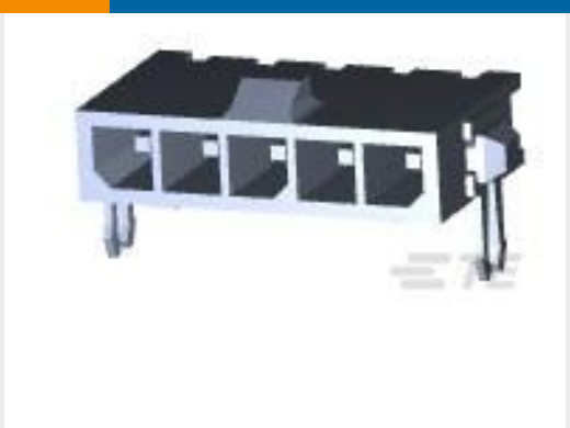
TE Part #2-1445090-5 MICRO MNL HDR ASSY S/ROW AU LF