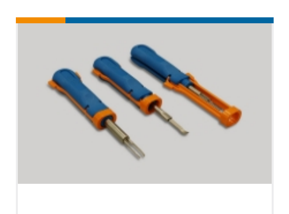
Insertion & Extraction Tools(7)