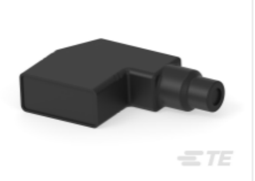
TE Part # DRC40-BT-90DEG BOOT, 40P, 16SZ, PLG/REC, RA, BLK