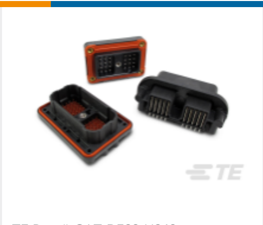
TE Part # CAT-D799-H342 DEUTSCH DRC Headers