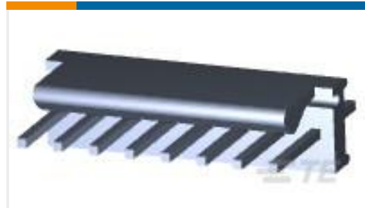
TE Part #640456-8 08P MTA100 HDR ASSY F/L SQ STR