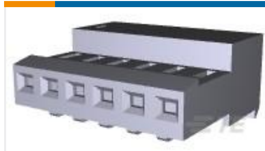
TE Part #3-640441-6 06P MTA100 CONN ASSY WHT