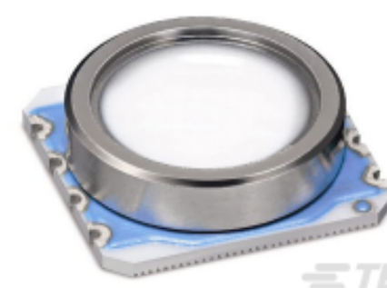
TE Part # MS580305BA01-00 MS5803-05BA 5BAR WHITE GEL TUBE