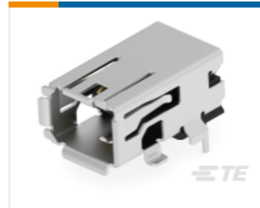
TE Part #2294417-1 INDUSTRIAL MINI I/O HDR TYPE I EMBOSS