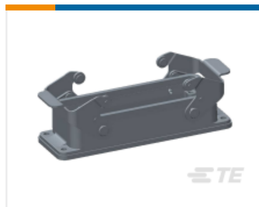
TE Part #T1410241000-000 H24B-AGS