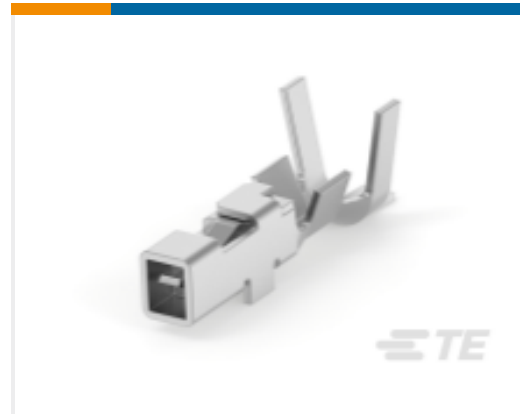
TE Part #1827588-2 Contact: Component To Wire; 3-5A, 30-18 Wire Size