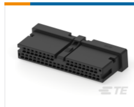
TE Part #3-2834497-6 MINI DYNAMIC REC HSG ASSY 36P Y- KEY BLK