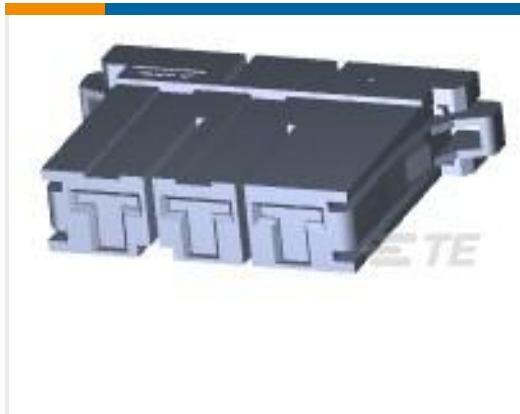
TE Part #1-179958-3 DYNAMIC D-5200S REC HSG 3P K/X