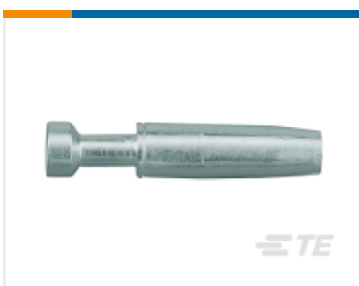
TE Part #T2030002015-000 CEF-1.5