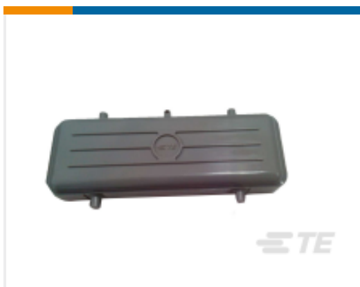
TE Part #T1010242100-000 H24B-KDBP