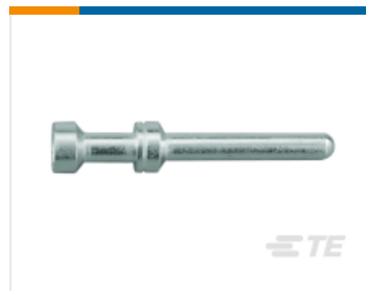
TE Part #T2030001005-000 CEM-0.5