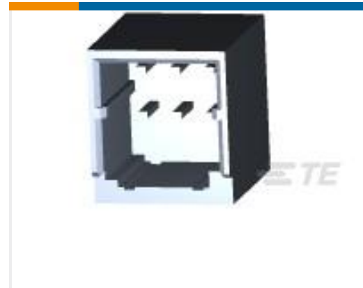
TE Part #1-1827875-3 DYNAMIC 1200D HDR ASSY V 6P X BLACK GOLD