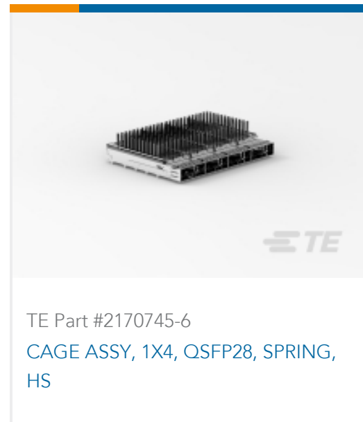
TE Part #2170745-6 CAGE ASSY, 1X4, QSFP28, SPRING, HS