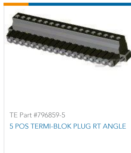
TE Part #796859-5 5 POS TERMI-BLOK PLUG RT ANGLE