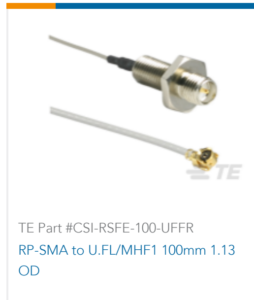
TE Part #CSI-RSFE-100-UFFR RP-SMA to U.FL/MHF1 100mm 1.13 OD