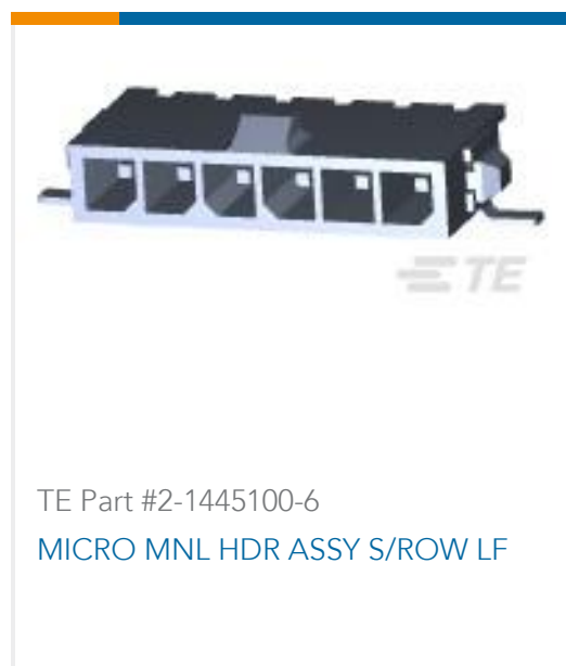
TE Part #2-1445100-6 MICRO MNL HDR ASSY S/ROW LF