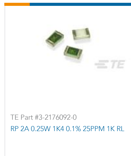
TE Part #3-2176092-0 RP 2A 0.25W 1K4 0.1% 25PPM 1K RL