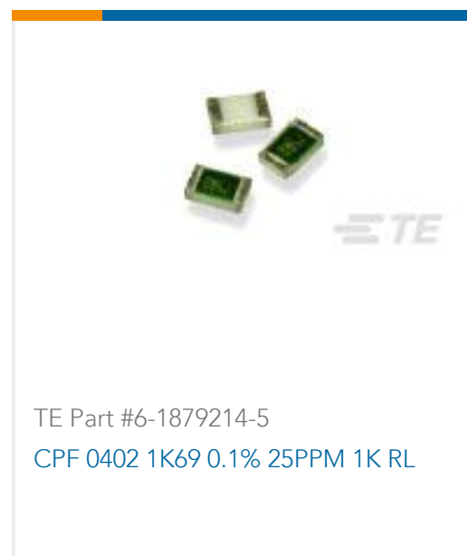
TE Part #6-1879214-5 CPF 0402 1K69 0.1% 25PPM 1K RL