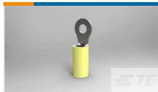
TE Part #35787 TERMINAL,PIDG R 12-10 8