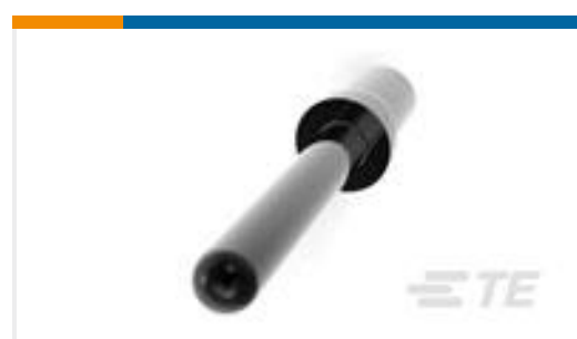
TE Part #1766193-1 CONTACT,PIN,SIZE #12