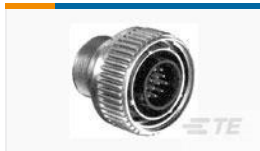
TE Part #208472-1 CMC PLUG ASSEMBLY,SZ 28