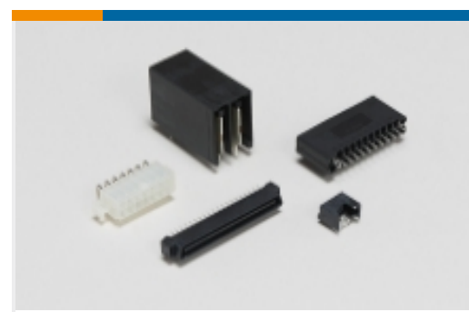
Standard Rectangular Connectors(5)