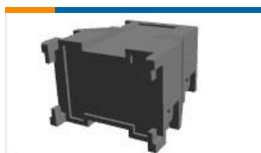
TE Part #207088-1 METRIMATE,STR REL KIT,24P