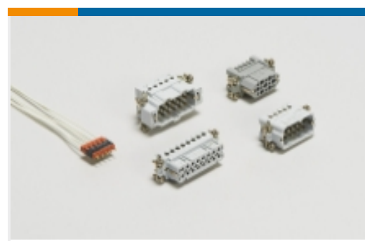
Rectangular Contact Inserts(4)