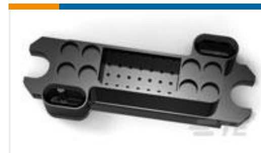
TE Part #1648203-1 297-08-01100=SA CONN,PIN