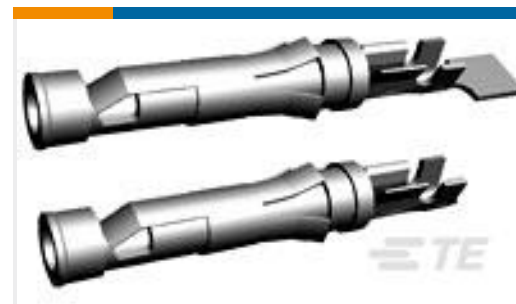
TE Part #66428-4 III+ SKT,30-26,30AU/FL,LP