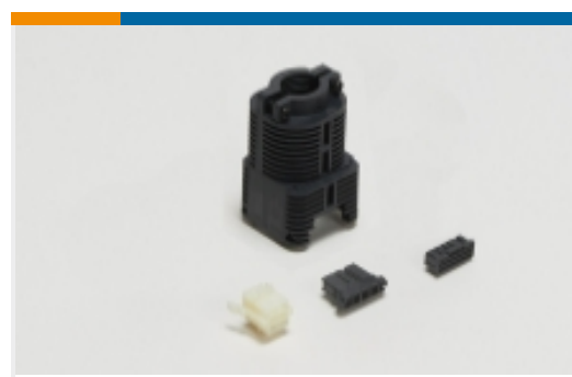
Rectangular Connector Housings(35)