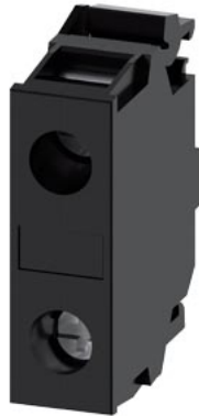
Support terminal, black, screw terminal, for floor mounting