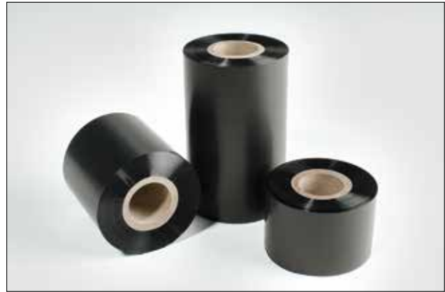
Ribbons for printing on Tubing and TipTags.