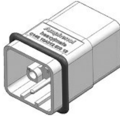
C146 10A012 500 12 12 + PE Male contact insert with compact design