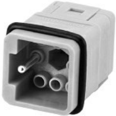
C146 10A007 500 12 7+PE Male contact insert with compact design, A3