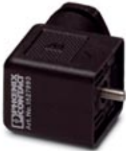
Valve connector, 3-pos., type BI, unconnected, screw connection, cable screw connection Pg9

Please be informed that the data shown in this PDF Document is generated from our Online Catalog. Please find the complete data in the user's documentation. Our General Terms of Use for Downloads are valid ( http://phoenixcontact.com/download )