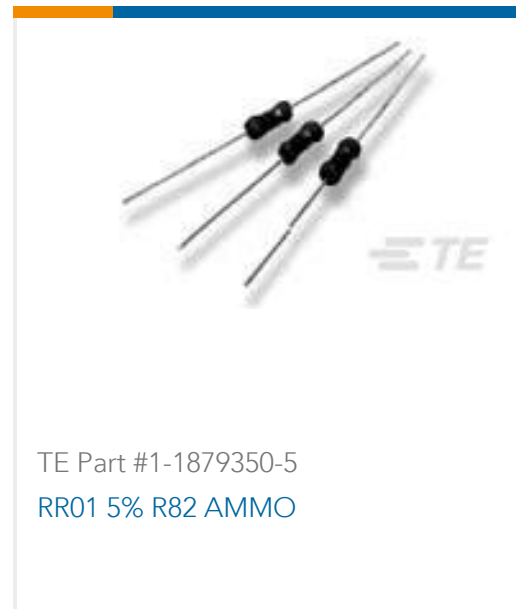
TE Part #1-1879350-5 RR01 5% R82 AMMO