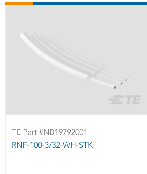
TE Part #NB19792001 RNF-100-3/32-WH-STK