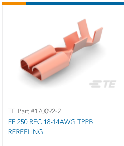
TE Part #170092-2 FF 250 REC 18-14AWG TPPB REREELING