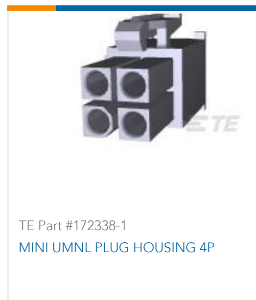
TE Part #172338-1 MINI UMNL PLUG HOUSING 4P