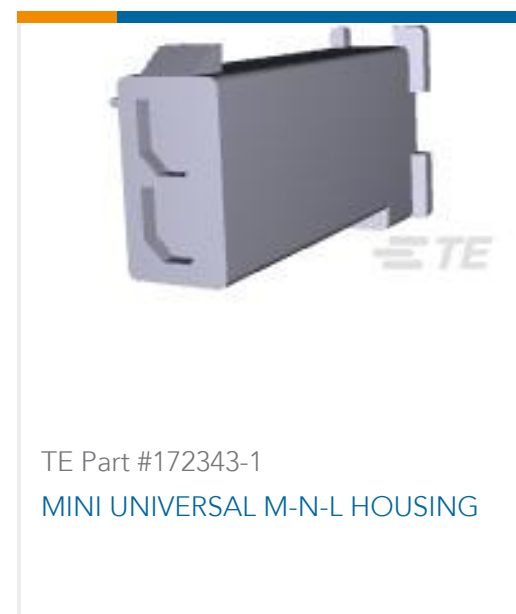
TE Part #172343-1 MINI UNIVERSAL M-N-L HOUSING