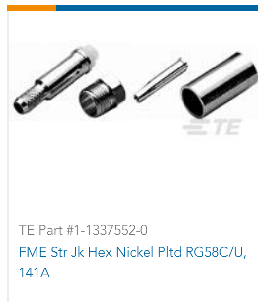
TE Part #1-1337552-0 FME Str Jk Hex Nickel Pltd RG58C/U, 141A