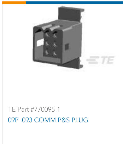
TE Part #770095-1 09P .093 COMM P&S PLUG