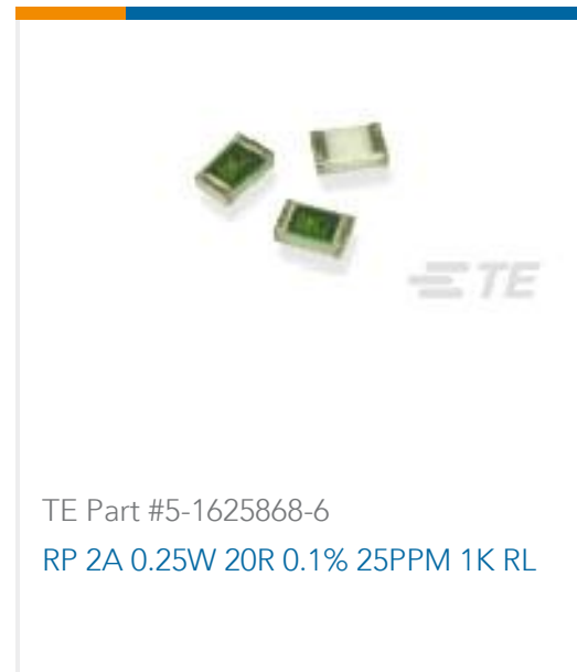
TE Part #5-1625868-6 RP 2A 0.25W 20R 0.1% 25PPM 1K RL