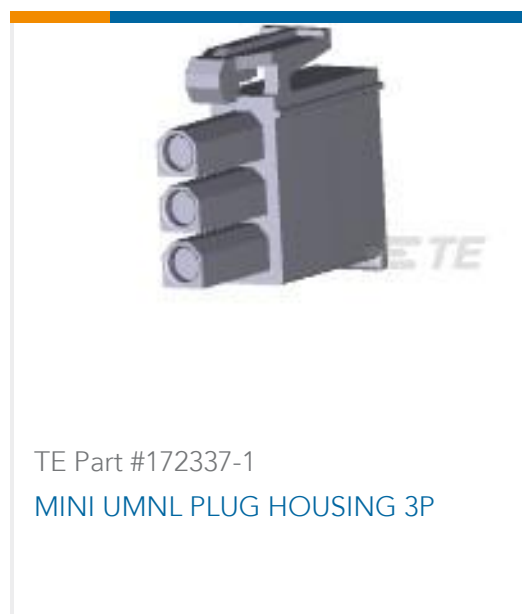
TE Part #172337-1 MINI UMNL PLUG HOUSING 3P