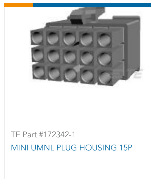
TE Part #172342-1 MINI UMNL PLUG HOUSING 15P