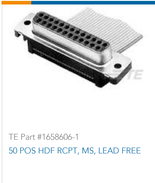
TE Part #1658606-1 50 POS HDF RCPT, MS, LEAD FREE