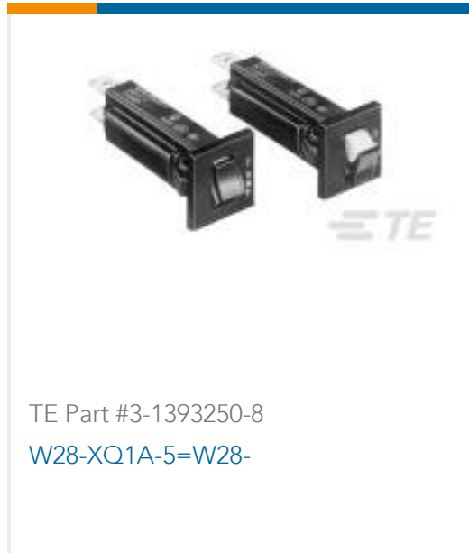
TE Part #3-1393250-8 W28-XQ1A-5=W28-