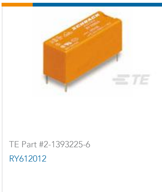
TE Part #2-1393225-6 RY612012