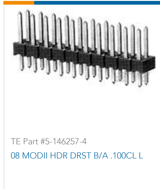
TE Part #5-146257-4 08 MODII HDR DRST B/A .100CL L