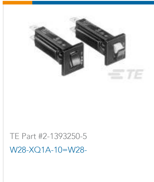
TE Part #2-1393250-5 W28-XQ1A-10=W28-