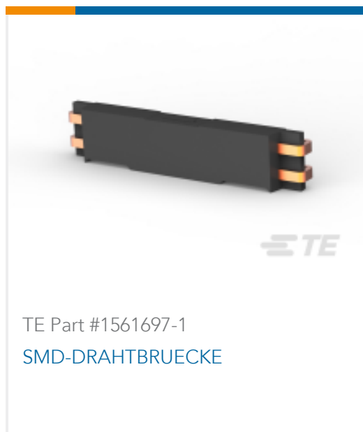
TE Part #1561697-1 SMD-DRAHTBRUECKE