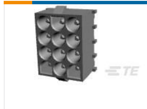
TE Part #350713-1 12P UMNL PIN HDR ASSY 94VO