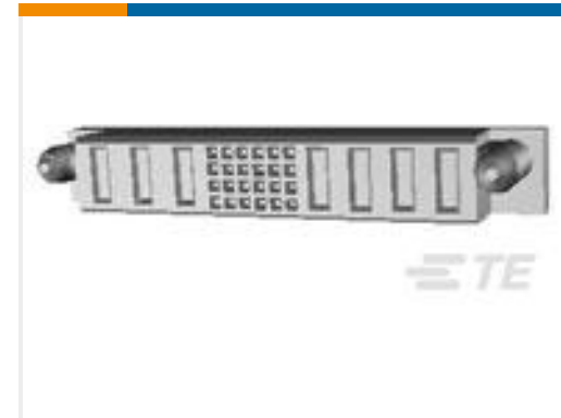
TE Part #6450150-3 MBXL VERT RCPT 4P+24S+3ACP