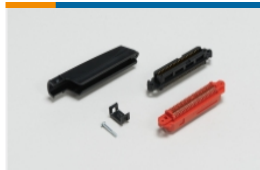
IDC D-Sub Connectors(1)