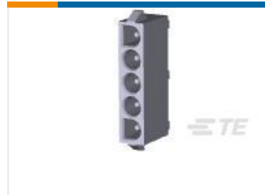
TE Part #640900-1 05P UMNL PIN HDR ASSY 94VO