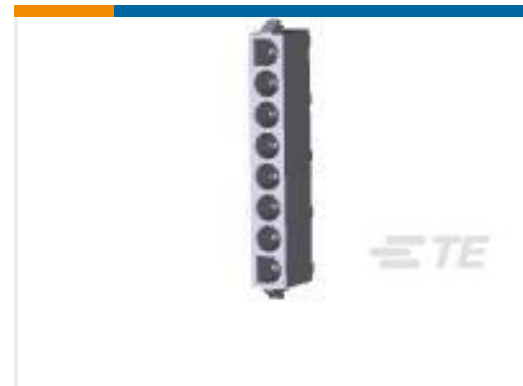
TE Part #641828-1 08P UMNL PIN HDR ASSY 94VO