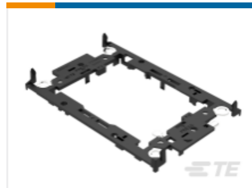
TE Part #2-2330552-2 ICX POINT PHM CARRIER ASSY, P4