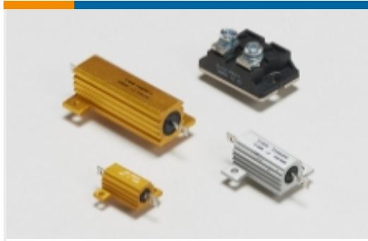
Chassis Mount Resistors(750)