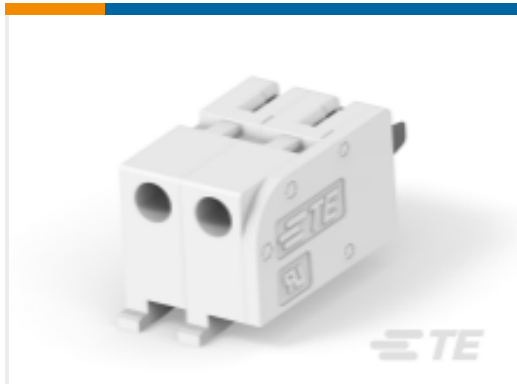
TE Part #2319461-2 TWO-PIECE POKE-IN, 5MM CONN, 2 POS