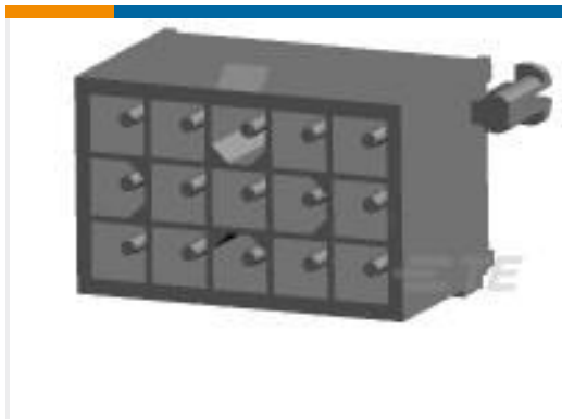
TE Part #1-770190-0 15P MINI-UMNL ASSY V0 SNNI*