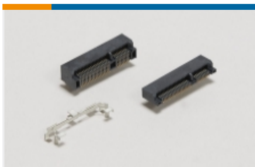
Mini PCI Express & mSATA(1)