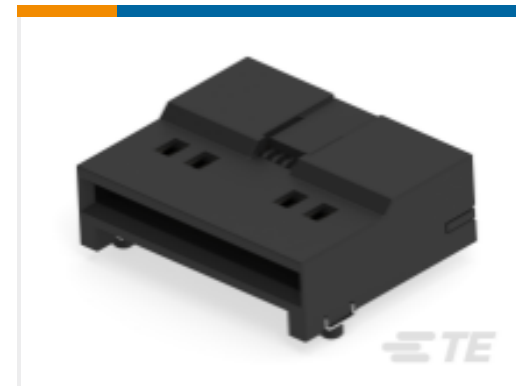
TE Part #2372928-2 QSFP112 Receptacle Assembly, Au, Washer