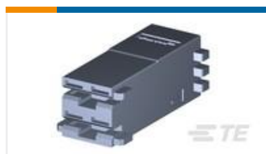
TE Part #521204-7 RAST 5,HSG,2P,POSILOCK MKIII