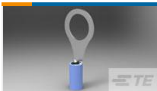
TE Part #328999 TERMINAL,PIDG R 16-14 3/8