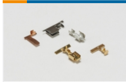
Special Purpose Terminals(1)