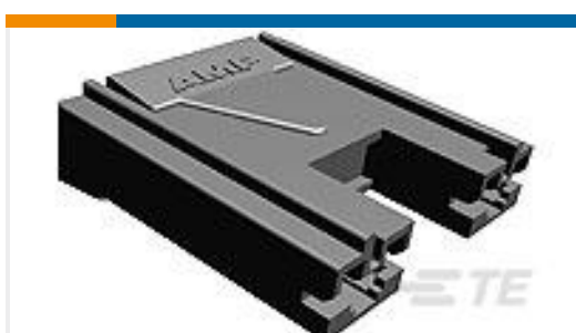
TE Part #176498-6 PL MKII 187 REC HSG 2P NYLON BLUE