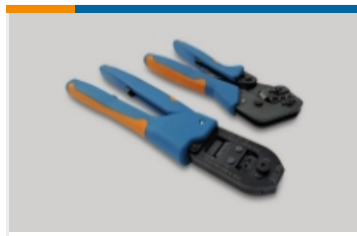
Hand Crimping Tools(2)