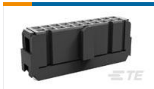
TE Part #1-1658621-2 64 NOVO MIL/CTR 15DP,LEAD FREE