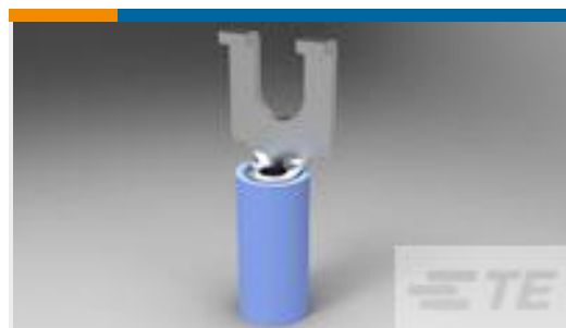
TE Part #2-320861-1 TERMINAL,PIDG SPD FLG 16-14 6