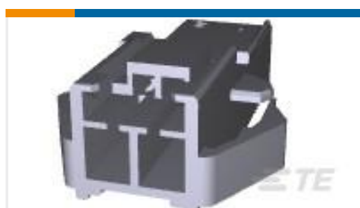
TE Part #176292-2 UNIV POWER CAP HSG 2P P/MOUNT