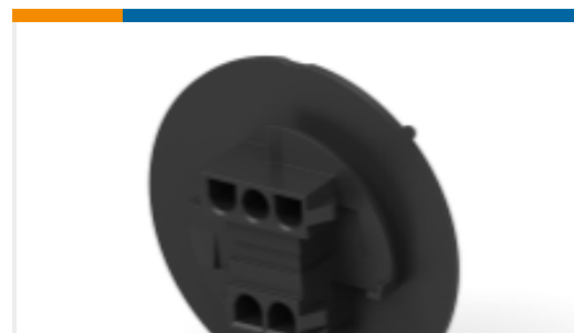
TE Part #2359624-1 UMNL TWIST-N-LOK, 5POS, .100" PANEL