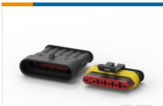
TE Part #282080-1 AMP SUPERSEAL 1.5MM, CONNECTOR HOUSING