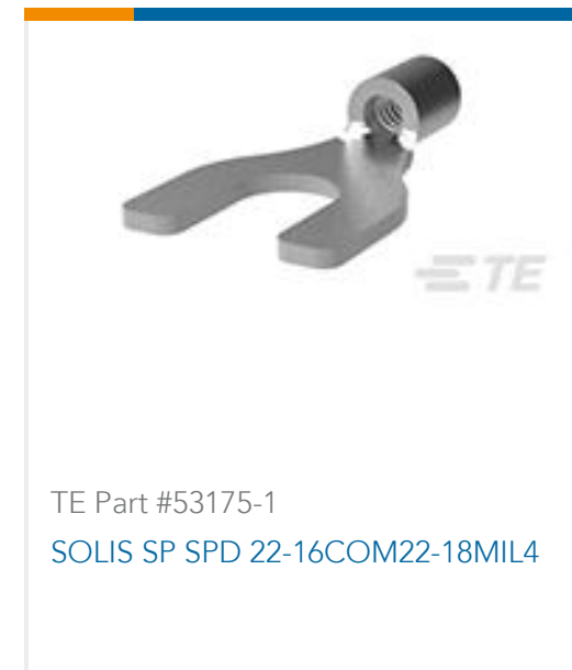
TE Part #53175-1 SOLIS SP SPD 22-16COM22-18MIL4