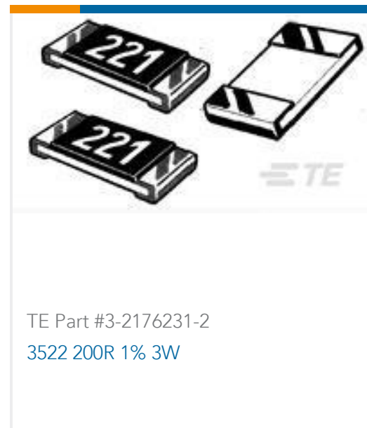
TE Part #3-2176231-2 3522 200R 1% 3W