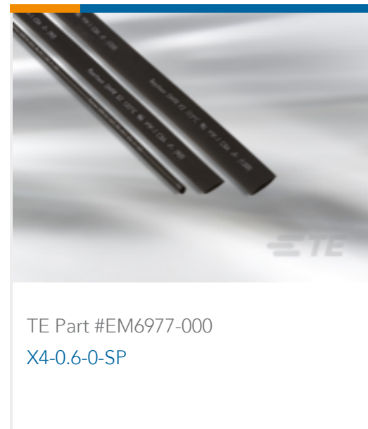
TE Part #EM6977-000 X4-0.6-0-SP