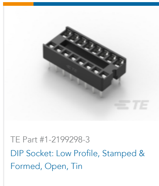
TE Part #1-2199298-3 DIP Socket: Low Profile, Stamped & Formed, Open, Tin