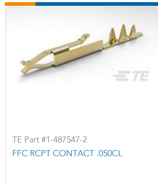
TE Part #1-487547-2 FFC RCPT CONTACT .050CL