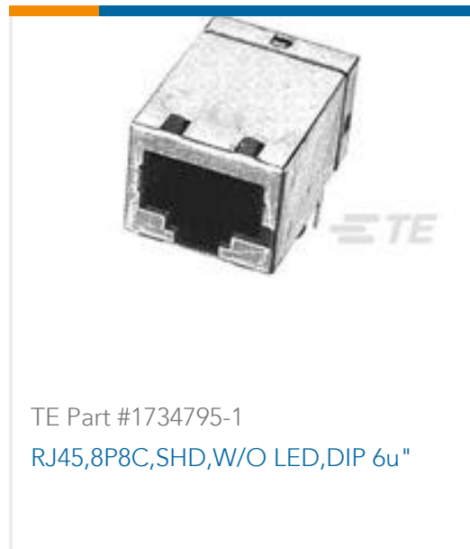
TE Part #1734795-1 RJ45,8P8C,SHD,W/O LED,DIP 6u"