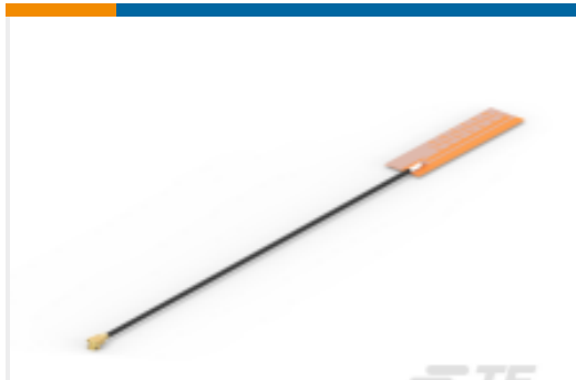
TE Part #2195835-3 ISM 868 / 915 MHz ANTENNA