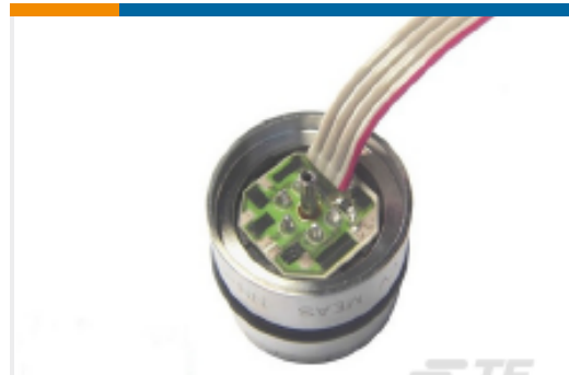
TE Part #154CV-050G-RT NISO,LP,CV,GA,R-CBL W/TUBE