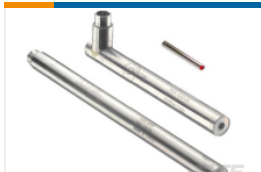
TE Part #02560413-000 LVDT HCA 050 ASSY