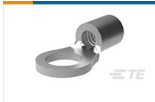
TE Part #33220 TERMINAL,SOLIS R 12-10 3/8