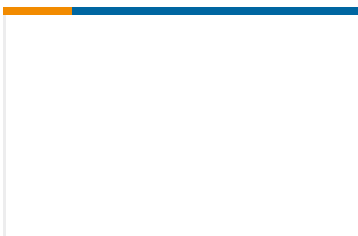
TE Part #GA10K3A1W2B DISC-- BTC