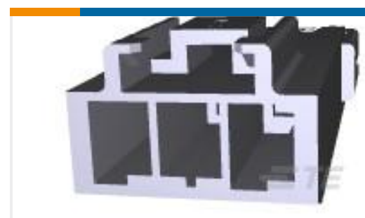
TE Part #368572-1 PDL 3P CAP 3.96 F/H(GWT) NAT