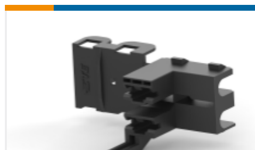
TE Part #2357275-1 POD-LOK 187 FLAG HSG. 2P NYLON BLACK