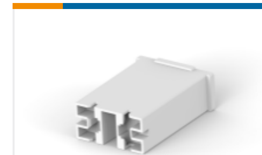
TE Part #2331087-1 250 HSG. PL MKII REC. 9mm 2P NAT PTPBR