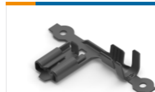
TE Part #2299293-2 POD-LOK 187 FLAG RCPT.AWG 20-16 PTPBR