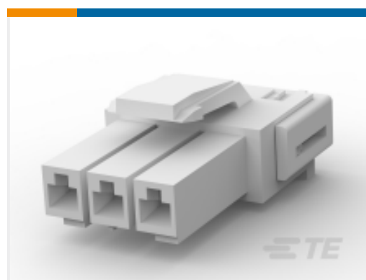
TE Part # 177899-1 POWER DBL LOCK PLUG HSG 3P