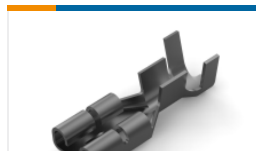
TE Part #63606-4 187 FASTON REC 18-14 AWG TPBR