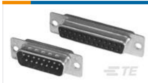
TE Part #5-747916-2 37 Plug Solder Cup, Gold Flash