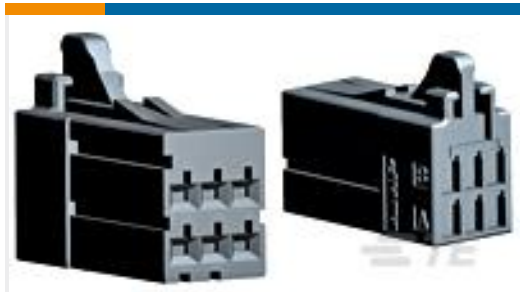
TE Part #1-1318119-3 DYNAMIC D-2100 REC HSG 6P