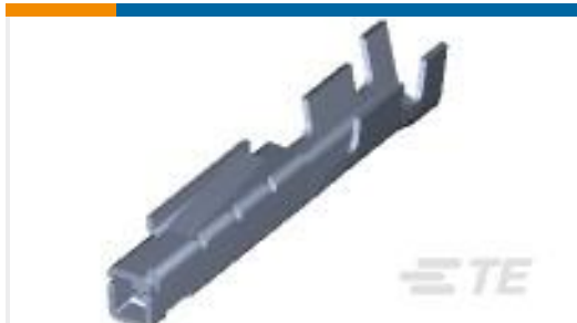
TE Part #1318107-1 DYNAMIC D-2000 REC CONT M L/P