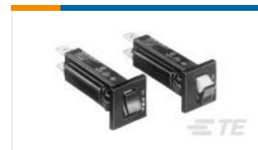
TE Part #1-1393250-7 W28-XQAT-15=W28