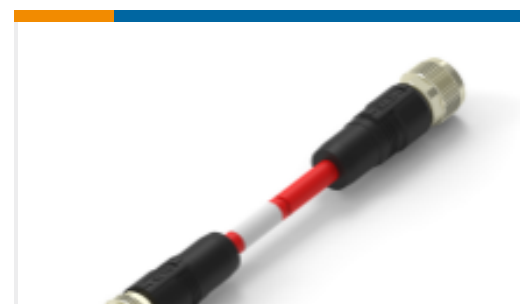
TE Part #TAA545B1411-060 M12A4-MS-FS-PVC-6.0M