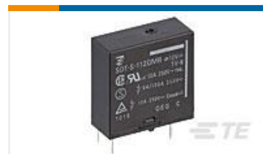
TE Part #8-1419125-5 SDT-S-106LMR,000