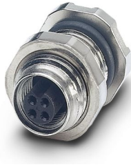
Device connector rear mounting, 4-position, Socket, straight, M5, Rear mounting, M5 x 0.5, Solder pins

Please be informed that the data shown in this PDF document is generated from our online catalog. Please find the complete data in the user documentation. Our general terms of use for downloads are valid.