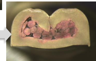
Visible deformation of outer crimp surface because of indentation from material buildup on crimper.

Chromium plating has the ability to be applied uniformly and consistently and exhibits excellent adhesion to the base metals. The unique benefits of chromium plating, such as ease of application, consistency of plating, adhesion to base metal, extremely low coefficient of friction, very high hardness, and resistance to adhesion, make it truly difficult to match in crimp performance and durability. However many alternative coatings are being attempted, and some show excellent promise in specific applications.