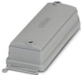
Protective cover B16, Clip locking, Protective cover material: PA, With lanyard

Please be informed that the data shown in this PDF Document is generated from our Online Catalog. Please find the complete data in the user's documentation. Our General Terms of Use for Downloads are valid ( http://phoenixcontact.com/download )