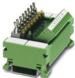
VARIOFACE switch module, with COMBICON connector, for simulation, for 8 signals, for mounting DIN rail NS 35

Please be informed that the data shown in this PDF Document is generated from our Online Catalog. Please find the complete data in the user's documentation. Our General Terms of Use for Downloads are valid ( http://phoenixcontact.com/download )