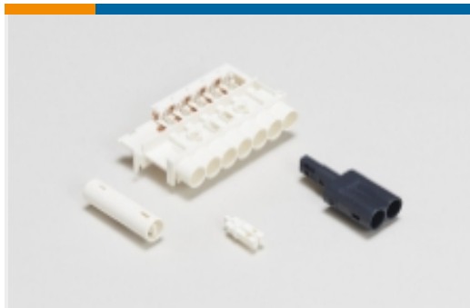
Plug &amp; Socket Lighting Connectors(33)