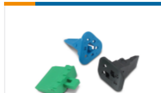
TE Part #W2S Wedgelocks: DEUTSCH DT