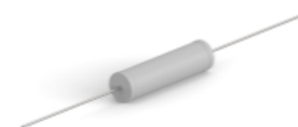
TE Part #4-2176414-8 7W STD M/OX 5% 1K8