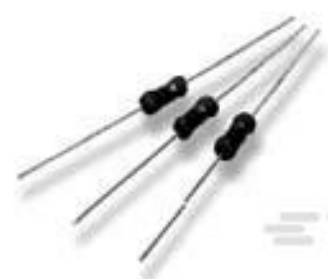
TE Part #4-1879350-2 RR01 5% 11R AMMO