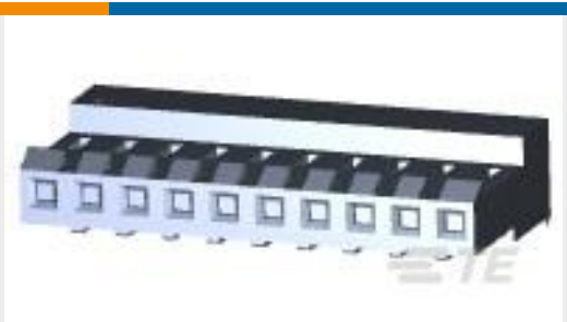
TE Part #4-640428-0 10P MTA156 CONN ASSY 22AWG RED