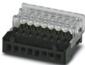
SmartWire DT™ flat plug, 8-pos.

Please be informed that the data shown in this PDF Document is generated from our Online Catalog. Please find the complete data in the user's documentation. Our General Terms of Use for Downloads are valid ( http://phoenixcontact.com/download )