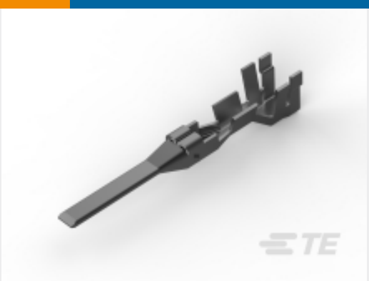
TE Part #177917-1 Power Double Lock Tab