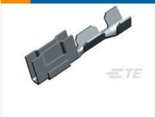
TE Part #1445336-1 LOOSE PC CONTACT TIN PLATED