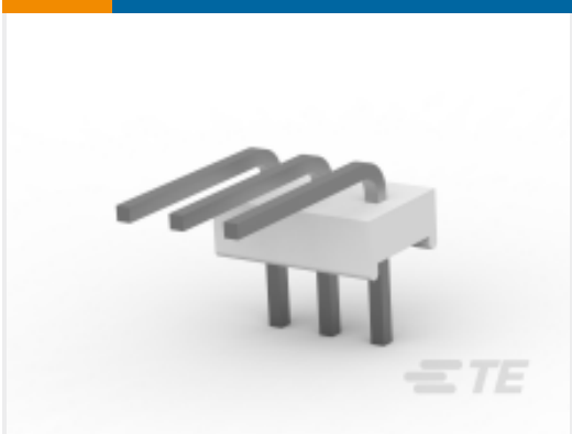
TE Part #640457-6 PCB Header: Polyester, Right Angle, Unshrouded