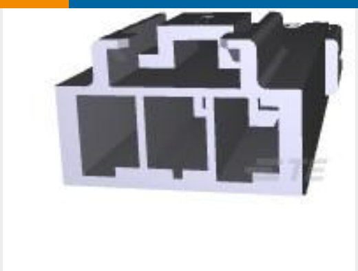
TE Part #179464-1 POWER DBL LOCK CAP HSG F/H 3P