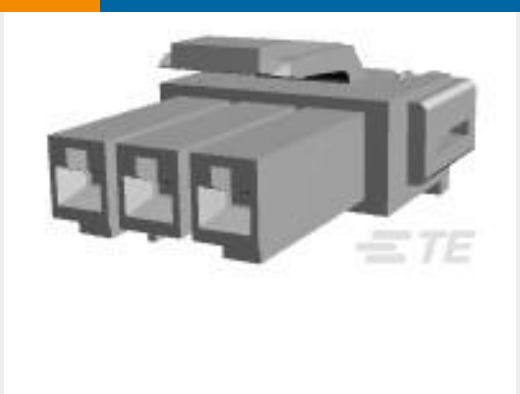
TE Part #177899-1 POWER DBL LOCK PLUG HSG 3P