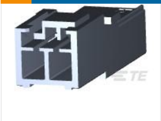
TE Part #176282-1 AMP UNIVERSAL POWER CAP 2P