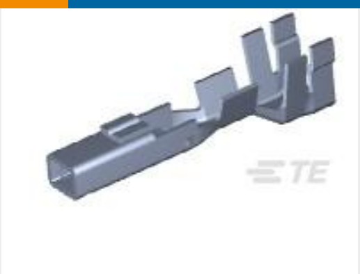
TE Part #179592-1 AMP POWER D/LOCK REC CONT. L/P