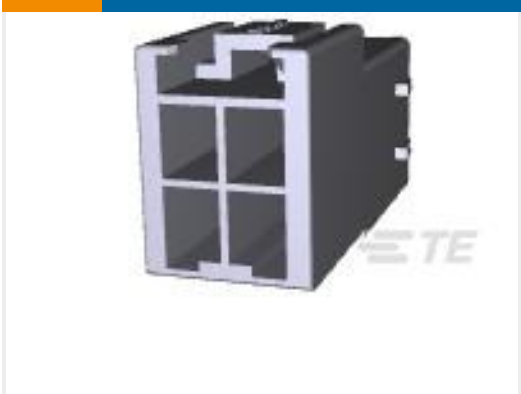
TE Part #179465-1 AMP POWER DBL LOCK CAP HSG 4P