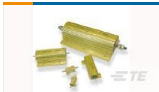
TE Part #8-1625966-0 HSA10 47R 5%