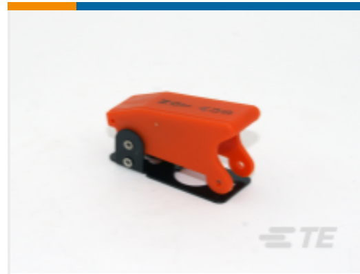
TE Part # K1003000 Switch guard 08-0-0-02