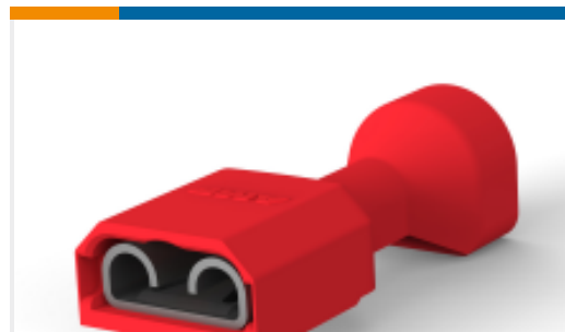
TE Part #5-520263-2 ULTRA-FAST 250 ASY REC 22-18 AWG TPBR