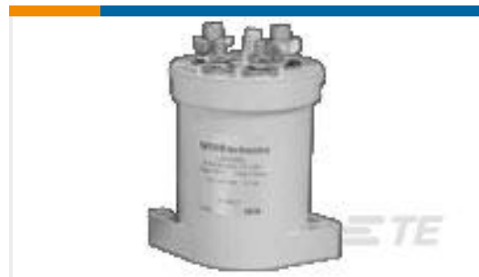
TE Part #9-1618389-8 LEV100A5ANG=RELAY, SPST, 24Vdc