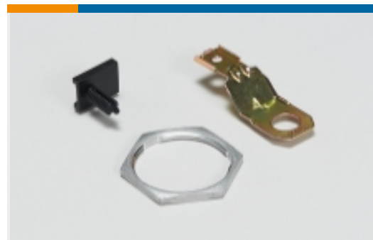
Other Automotive Connector Accessories(1)