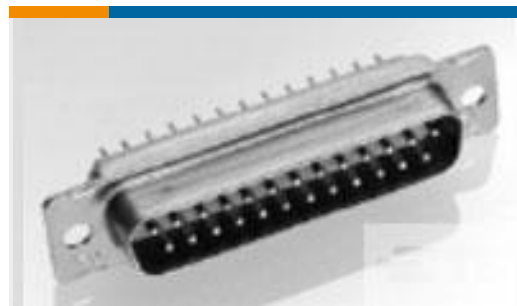
TE Part #205168-1 AMPLIMITE,ASY,PLUG,STD,109,4