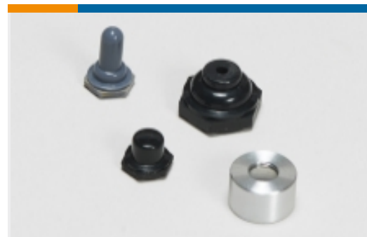
Switch Seals & Accessories(7)