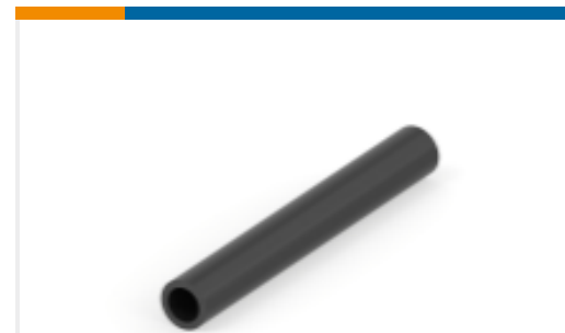
TE Part #EL6483-000 RBK-85-KIT-0107-A0