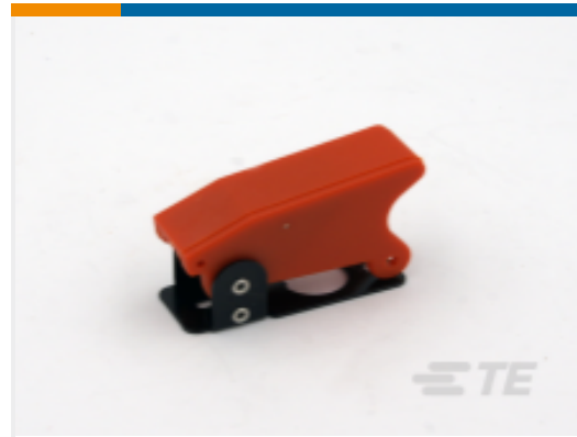
TE Part # K1022530 Switch guard 07-0-0-01