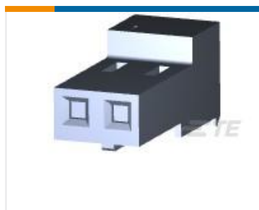
TE Part #3-640477-2 02 CIR MTA156 ASSY ON TAPE LF