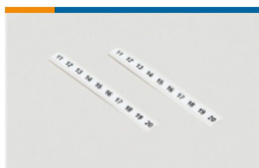
Terminal Block & Strip Marking Accessories(115)