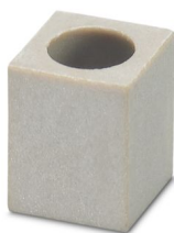
Bridge bar isolator, color: gray

https://www.phoenixcontact.com/us/products/1302338