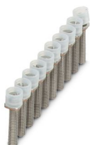
Bridge, pitch: 6 mm, number of positions: 10, color: silver

https://www.phoenixcontact.com/us/products/0301505