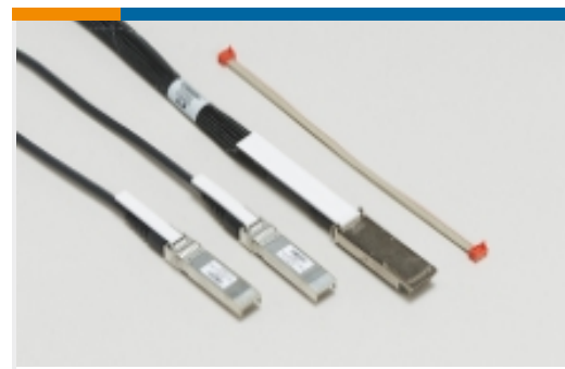
Pluggable I/O Cable Assemblies(78)