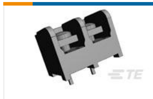
TE Part #3-1437652-9 6PCV-02-006=6PCV ASSEMBLY