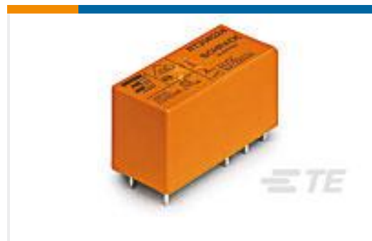
TE Part #8-1393243-5 RT425024