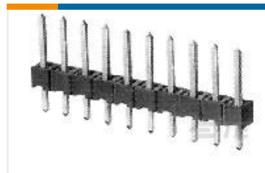
TE Part #1-826629-6 16X1 AMPMODU II HDR ST