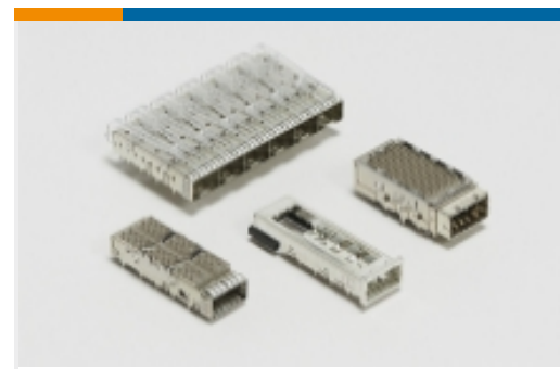
Pluggable IO Connectors & Cages(424)