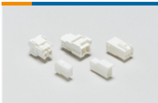
Rectangular Power Connectors(6)