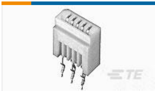
TE Part #1-84984-2 1mm FFC DIP V ASSY 12P TUBE