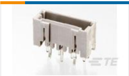
TE Part #292207-3 MINI CT SGL DIP V 3P NAT