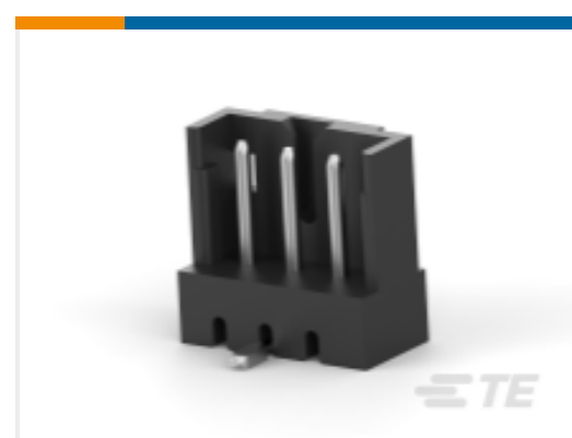
TE Part # 292172-3 CT POST HDR ASSY 3P IN-TUBE BL