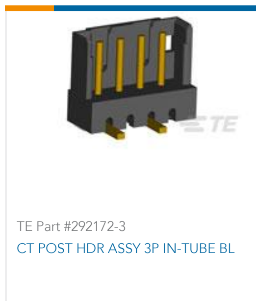
TE Part #292172-3 CT POST HDR ASSY 3P IN-TUBE BL