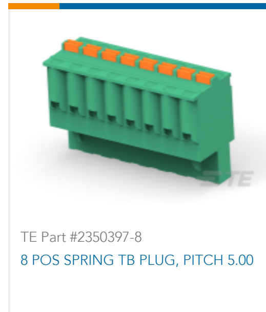
TE Part #2350397-8 8 POS SPRING TB PLUG, PITCH 5.00