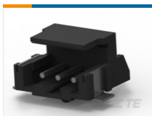
TE Part # 292173-3 CT BOX HDR H SMT 3P O/TAPE BLA