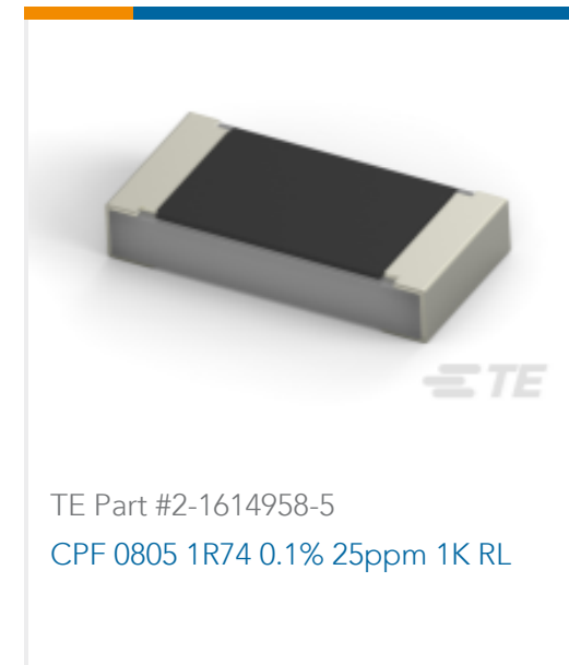
TE Part #2-1614958-5 CPF 0805 1R74 0.1% 25ppm 1K RL