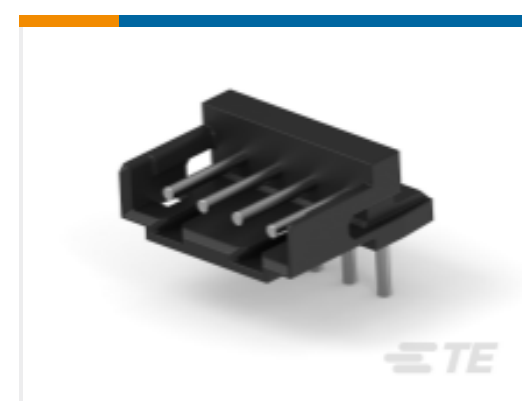
TE Part # CAT-3980407-RHDRRA CT 2mm Header Assembly: Right Angle