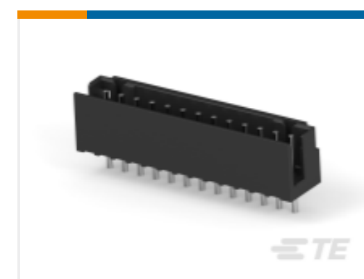
TE Part # CAT-3983178-PHBXVD CT 2mm Post Header Asmbly: Box V DIP