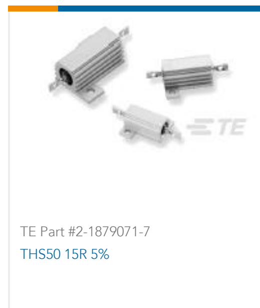
TE Part #2-1879071-7 THS50 15R 5%