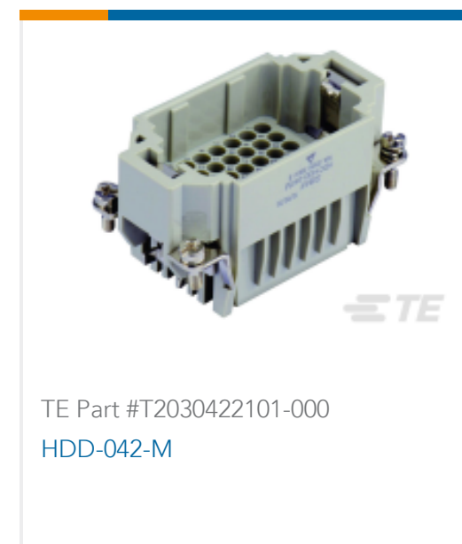
TE Part #T2030422101-000 HDD-042-M