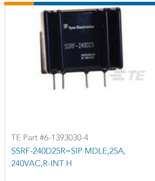
TE Part #6-1393030-4 SSRF-240D25R=SIP MDLE,25A, 240VAC,R-INT H