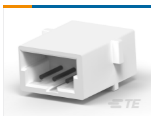
TE Part # 292156-3 CT RELAY HDR ASSY FREE HANGING