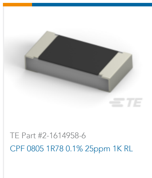
TE Part #2-1614958-6 CPF 0805 1R78 0.1% 25ppm 1K RL