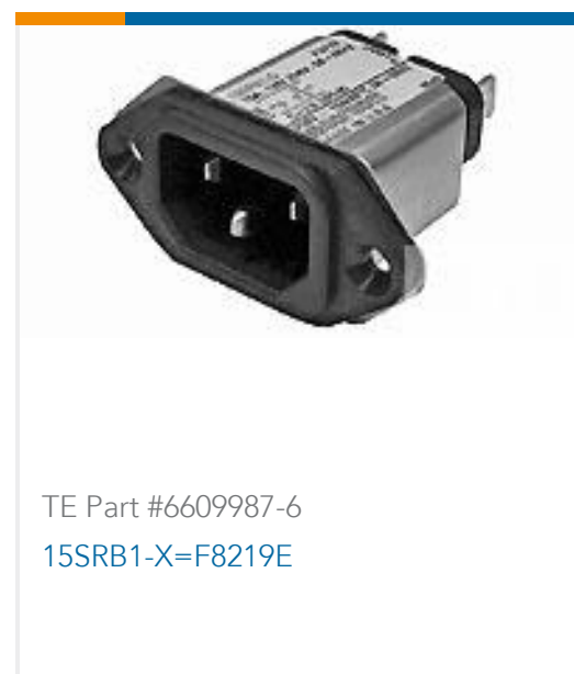
TE Part #6609987-6 15SRB1-X=F8219E