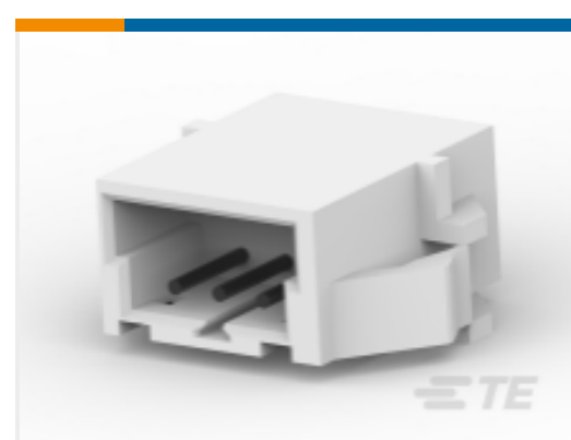
TE Part # 292254-3 CT RELAY HDR ASSY 3P NAT