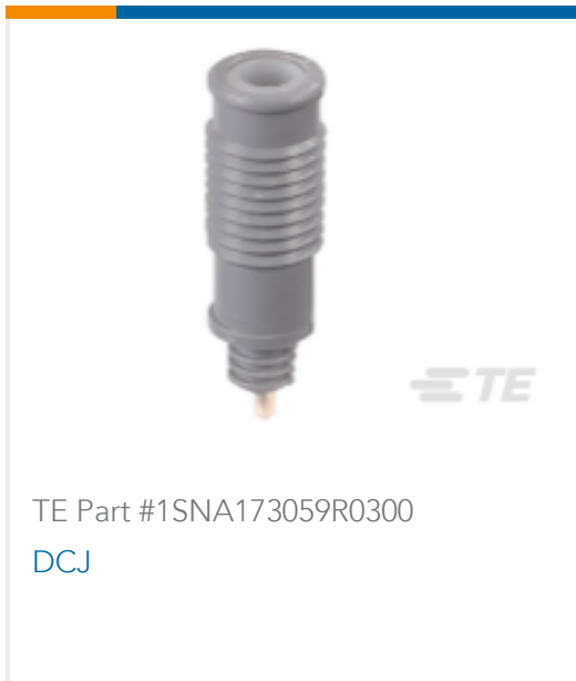
TE Part #1SNA173059R0300 DCJ