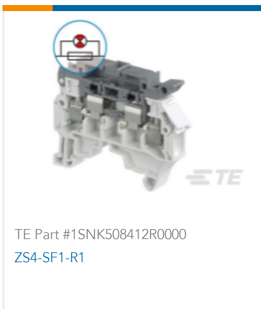
TE Part #1SNK508412R0000 ZS4-SF1-R1