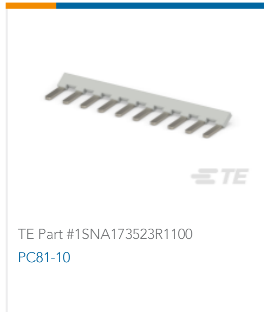
TE Part #1SNA173523R1100 PC81-10