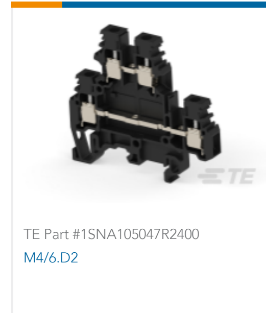
TE Part #1SNA105047R2400 M4/6.D2