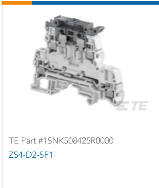
TE Part #1SNK508425R0000 ZS4-D2-SF1