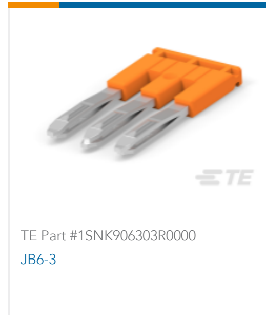
TE Part #1SNK906303R0000 JB6-3