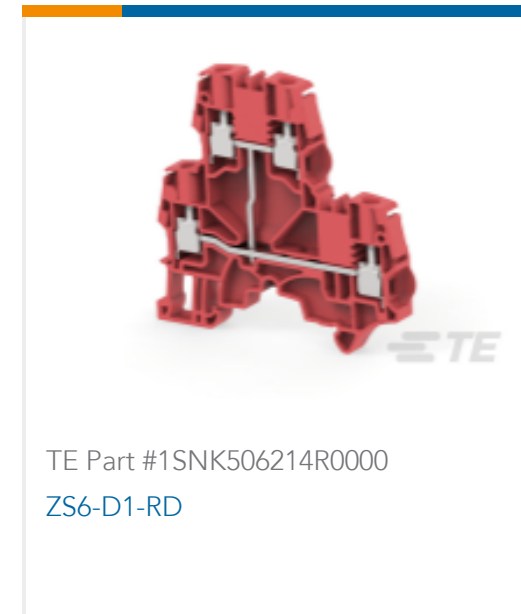
TE Part #1SNK506214R0000 ZS6-D1-RD