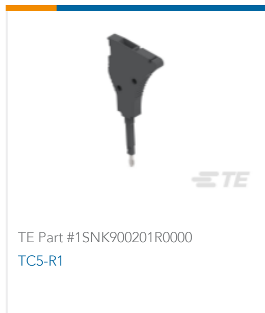
TE Part #1SNK900201R0000 TC5-R1