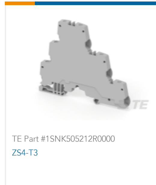
TE Part #1SNK505212R0000 ZS4-T3