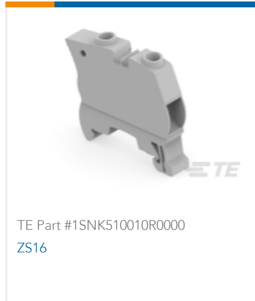
TE Part #1SNK510010R0000 ZS16