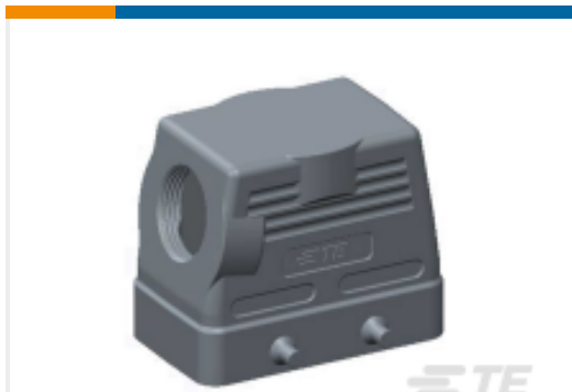
TE Part #T1210100116-000 H10B-TS-PG16