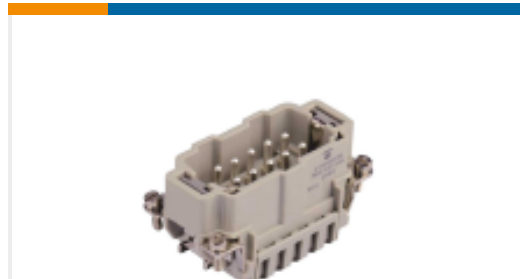
TE Part #T2040103101-000 HE-010-MS