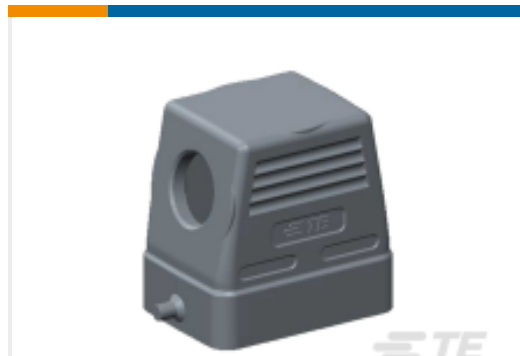
TE Part #T1310060113-000 H6B-TS-PG13.5