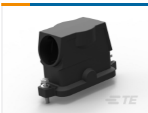
TE Part #T1912160140-000 H16BPR-TSHC-M40