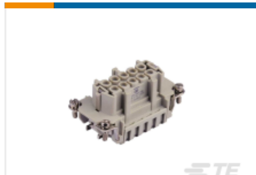
TE Part #T2040103201-000 HE-010-FS