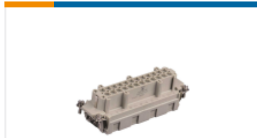
TE Part #T2040243201-000 HE-024-FS