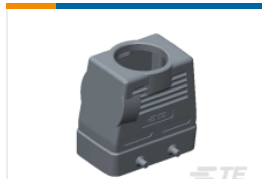
TE Part #T1240100121-000 H10B-TGH-PG21