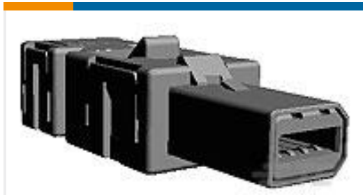
TE Part #2013595-1 INDUSTRIAL MINI I/O PLUG KIT D1