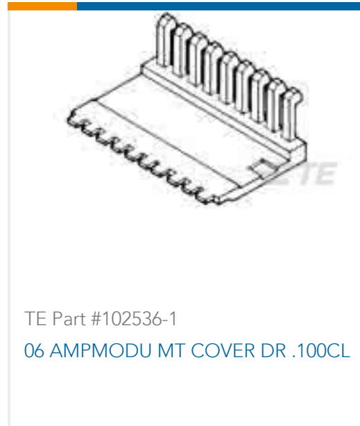
TE Part #102536-1 06 AMPMODU MT COVER DR .100CL