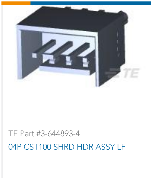
TE Part #3-644893-4 04P CST100 SHRD HDR ASSY LF