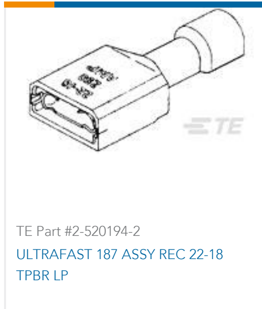
TE Part #2-520194-2 ULTRAFast 187 ASSY REC 22-18 TPBR LP