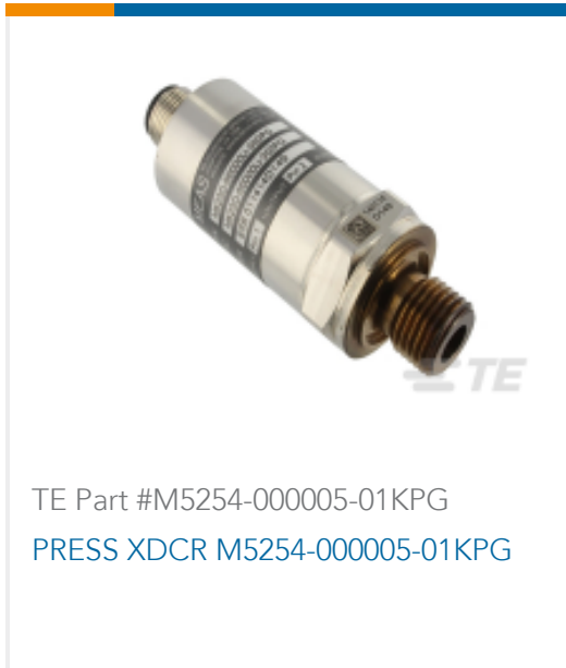
TE Part #M5254-000005-01KPG PRESS XDCR M5254-000005-01KPG