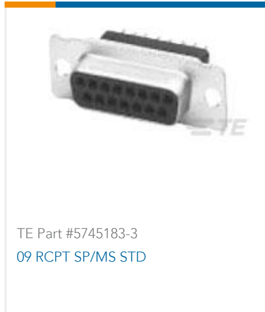
TE Part #5745183-3 09 RCPT SP/MS STD