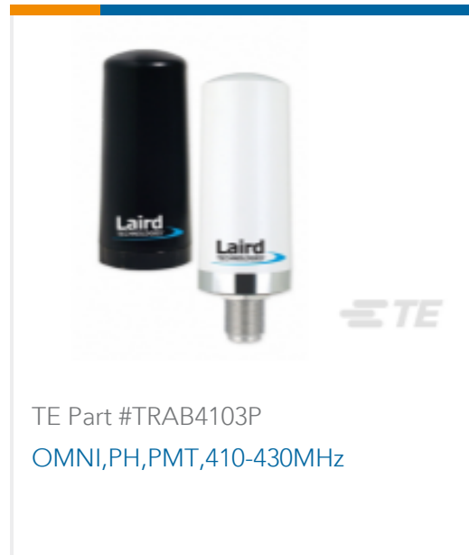
TE Part #TRAB4103P OMNI,PH,PMT,410-430MHz