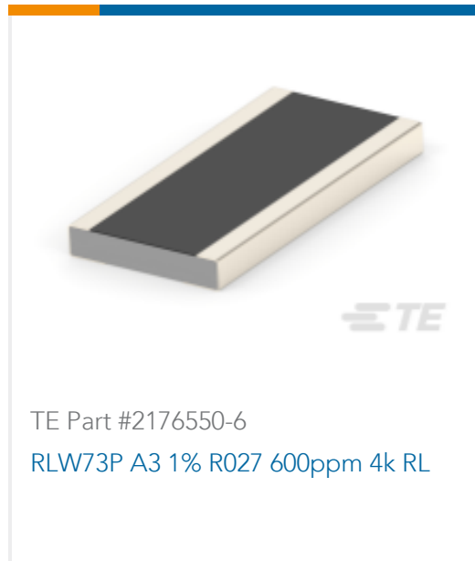
TE Part #2176550-6 RLW73P A3 1% R027 600ppm 4k RL