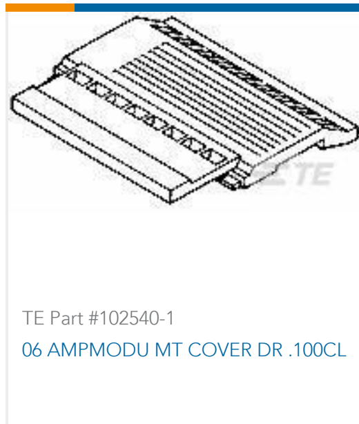
TE Part #102540-1 06 AMPMODU MT COVER DR .100CL