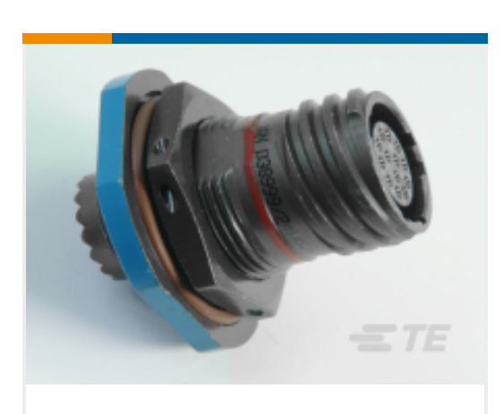
TE Part #YDTS24F21-35BNV001 RECP ASSY