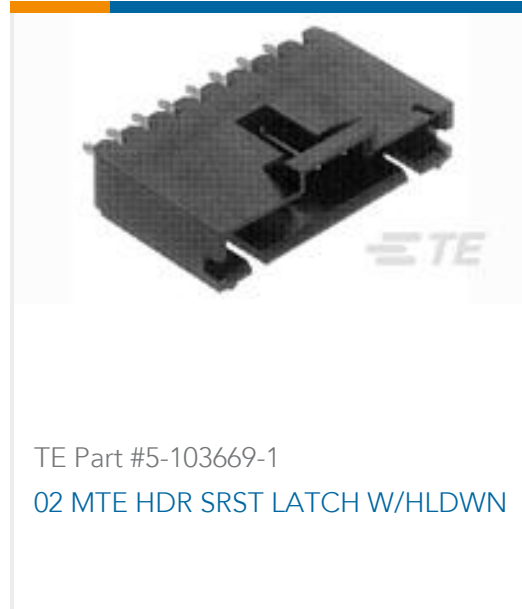
TE Part #5-103669-1 02 MTE HDR SRST LATCH W/HLDWN