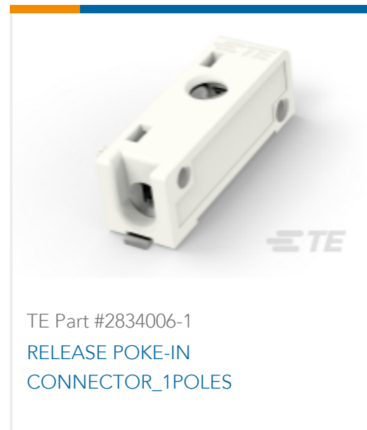
TE Part #2834006-1 RELEASE POKE-IN CONNECTOR_1POLES