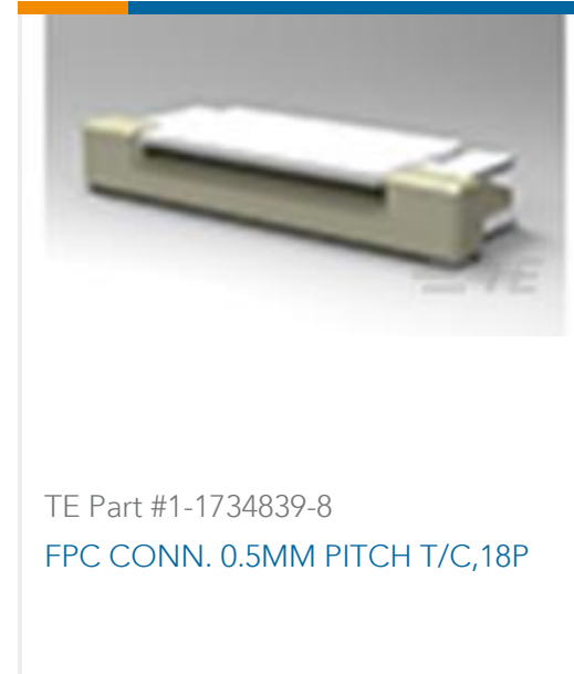
TE Part #1-1734839-8 FPC CONN. 0.5MM PITCH T/C,18P