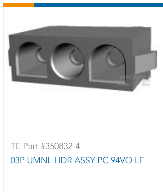
TE Part #350832-4 03P UMNL HDR ASSY PC 94VO LF