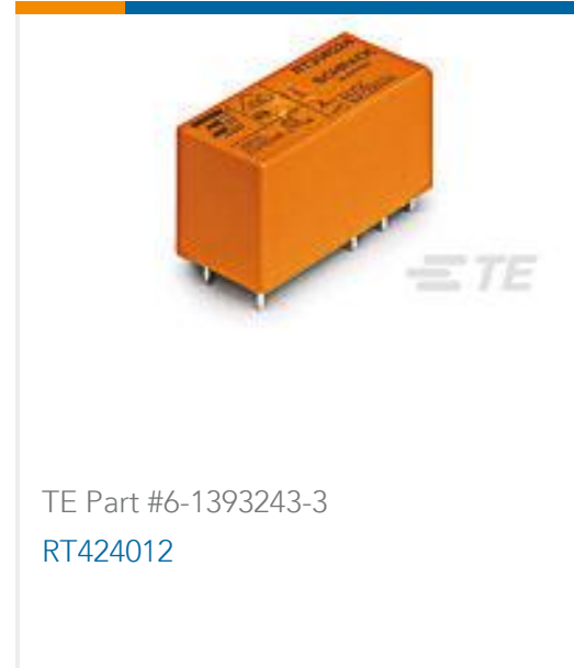
TE Part #6-1393243-3 RT424012