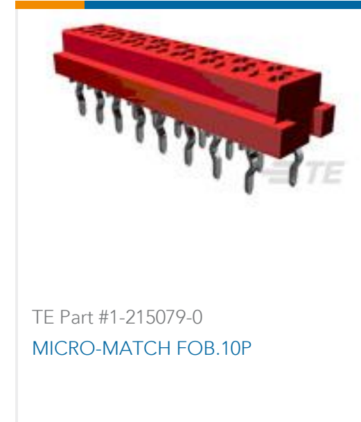
TE Part #1-215079-0 MICRO-MATCH FOB.10P