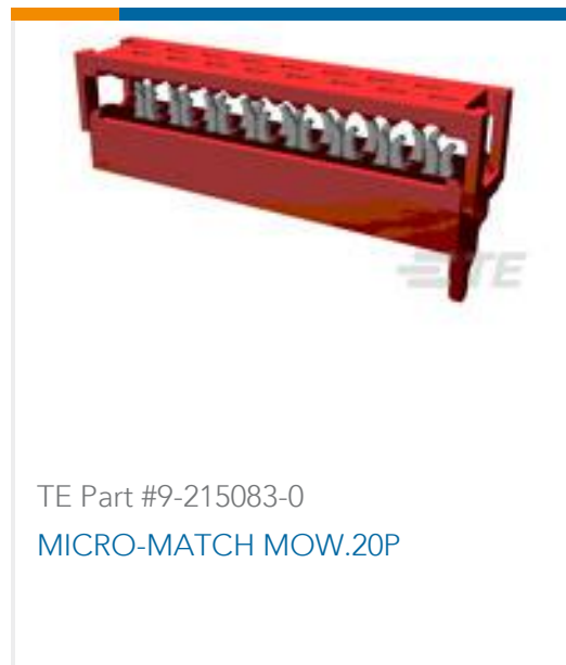
TE Part #9-215083-0 MICRO-MATCH MOW.20P