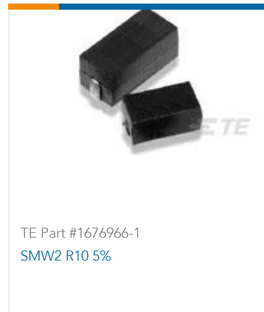
TE Part #1676966-1 SMW2 R10 5%