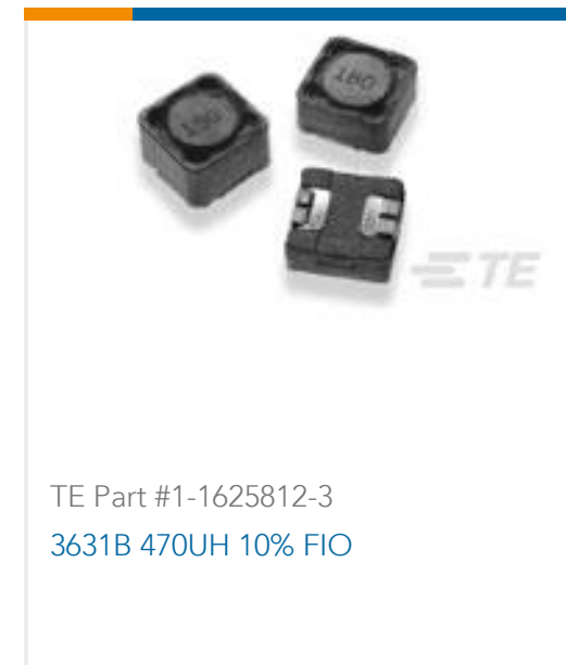
TE Part #1-1625812-3 3631B 470UH 10% FIO