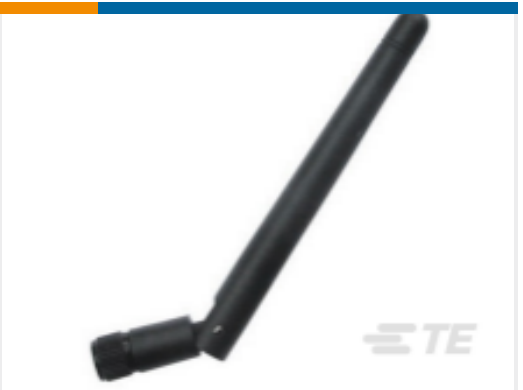
TE Part #001-0009 ANTENNA,2.4/5.5 GHz Dipole