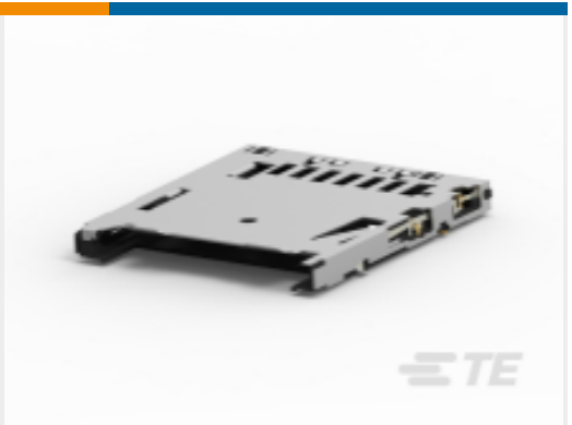
TE Part #1903302-3 SD RVS 0H EMBOSS ASSY