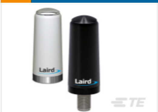
TE Part #TRA6927M3PW-001 OMNI,DB,Ph,698/1710 MHz WHT,3 dBi,100W,