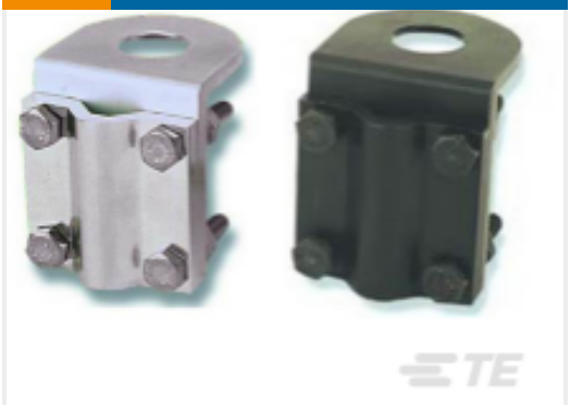
TE Part #LBMB9034-L MOUNT,MIR,3/4 BLK,STD,90DEG