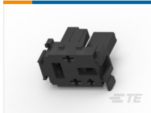
TE Part #1480838-1 MAXI RELAY SUPPORT