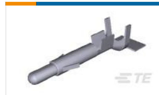
TE Part #350700-2 UMNL SPLIT PIN AU/NI/BR