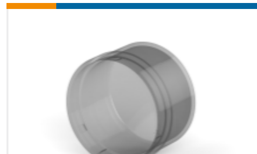
TE Part #2315539-1 COVER, LIGHT CONTROLLER, 81MM DIA., 62MM