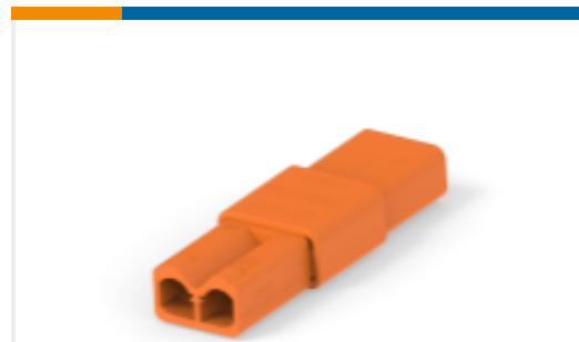
TE Part #2271203-1 2PIN WIRE TO WIRE CONNECTOR