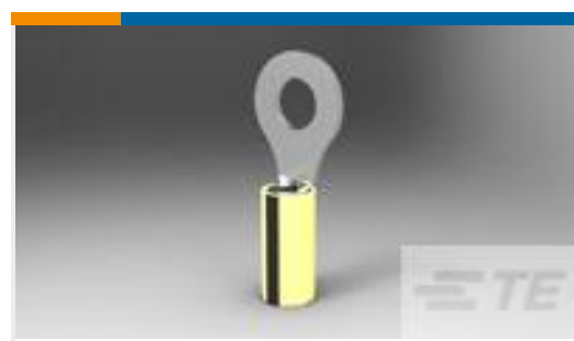
TE Part #1-327743-1 TERMINAL,PIDG R 16-14HD 1/4