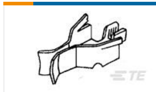
TE Part #63863-1 TWIST LOCK RECEPTACLE 18-14 AWG TPPHBZ