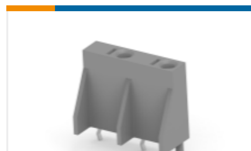
TE Part #1-2213629-2 CONN, INLINE VERT SCRLESS, SPECIAL PACK