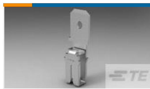
TE Part #63665-1 MAG-MATE 187 FAST TAB 020TPBR