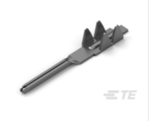
TE Part # 88976-2 CONTACT,PIN,TIN PLATE,FFC