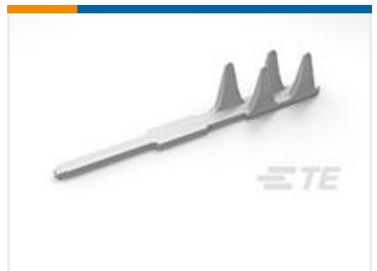
TE Part #487940-4 FFC,SLDR TAB CONTACT,.050" CNT