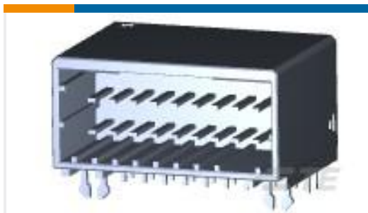
TE Part #1376137-2 DYNAMIC D2100 HDR H ASSY 20P Y