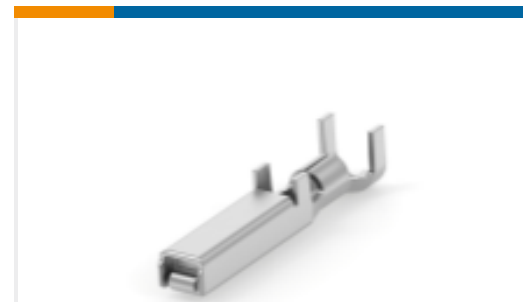
TE Part #353717-2 Contact: Component To Wire; 15A, 28-14 wire size