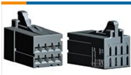
TE Part #2-1318119-4 DYNAMIC D2100 REC HSG 8P DBL Y