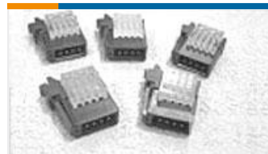
TE Part #2-1473562-4 RITS CONN. PLUG ASSY 4P BLUE