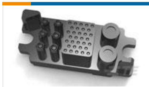
TE Part #1648157-1 242-28-01100