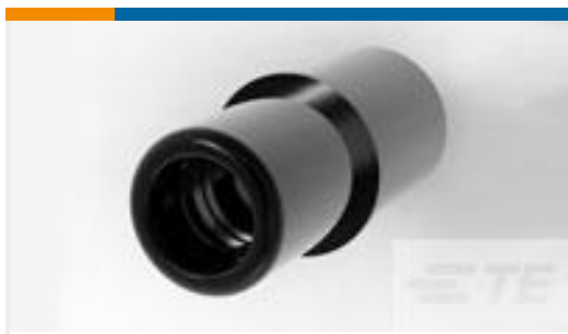
TE Part #6648405-1 CONTACT,SKT,SIZE #0