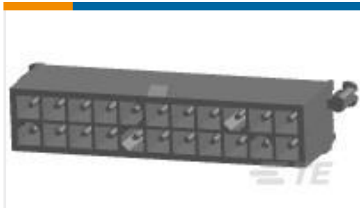
TE Part #1-794071-1 22P MINI UMNL HDR W/DH AU LF