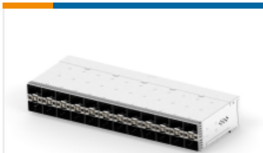
TE Part #2227838-9 2X12 ZSFP+ CONNECTOR ASSEMBLY