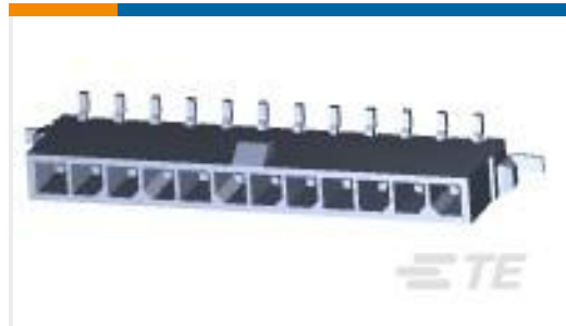
TE Part #3-1445087-2 MICRO MNL HDR ASSY S/ROW AU LF