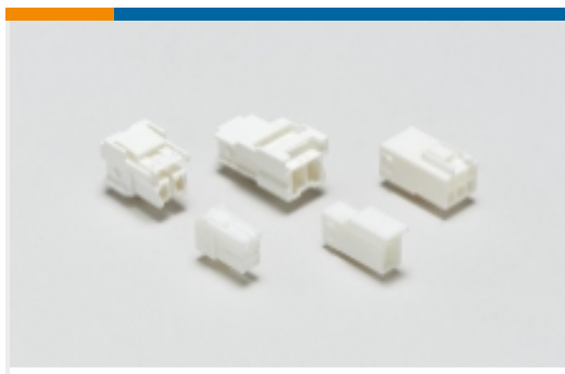
Rectangular Power Connectors(87)