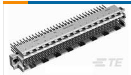
TE Part #2-1393659-6 V42254B1201R480=PC612 MESSERLE