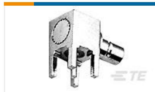
TE Part #1-1337481-0 SMB R/A PCB Skt 50Ohm Gold Plt