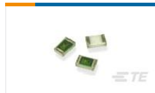
TE Part #3-1625867-2 RP 1J 0.166W 13R 0.1% 25PPM 1K RL