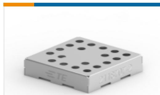
TE Part #2118707-2 1 PC STD SHIELD, CRS-16.50X16.50X3. 60MM