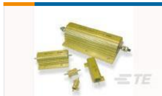
TE Part #8-1625984-1 HSA50 75R 5%