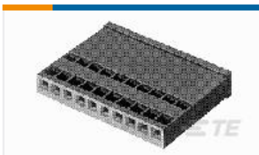
TE Part #2-87175-2 10 LOCKING CLIP HSG SR .100CL