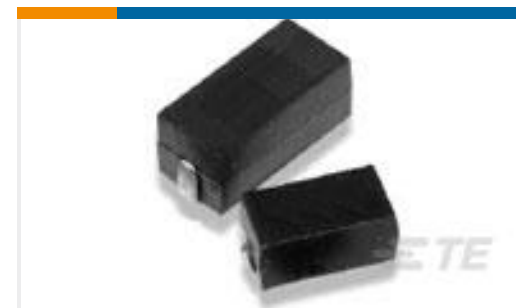
TE Part #6-1879233-1 SMW5 33R 5%