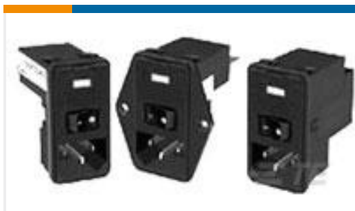
TE Part #6609108-2 PE0S0DZ6C M0=C7019